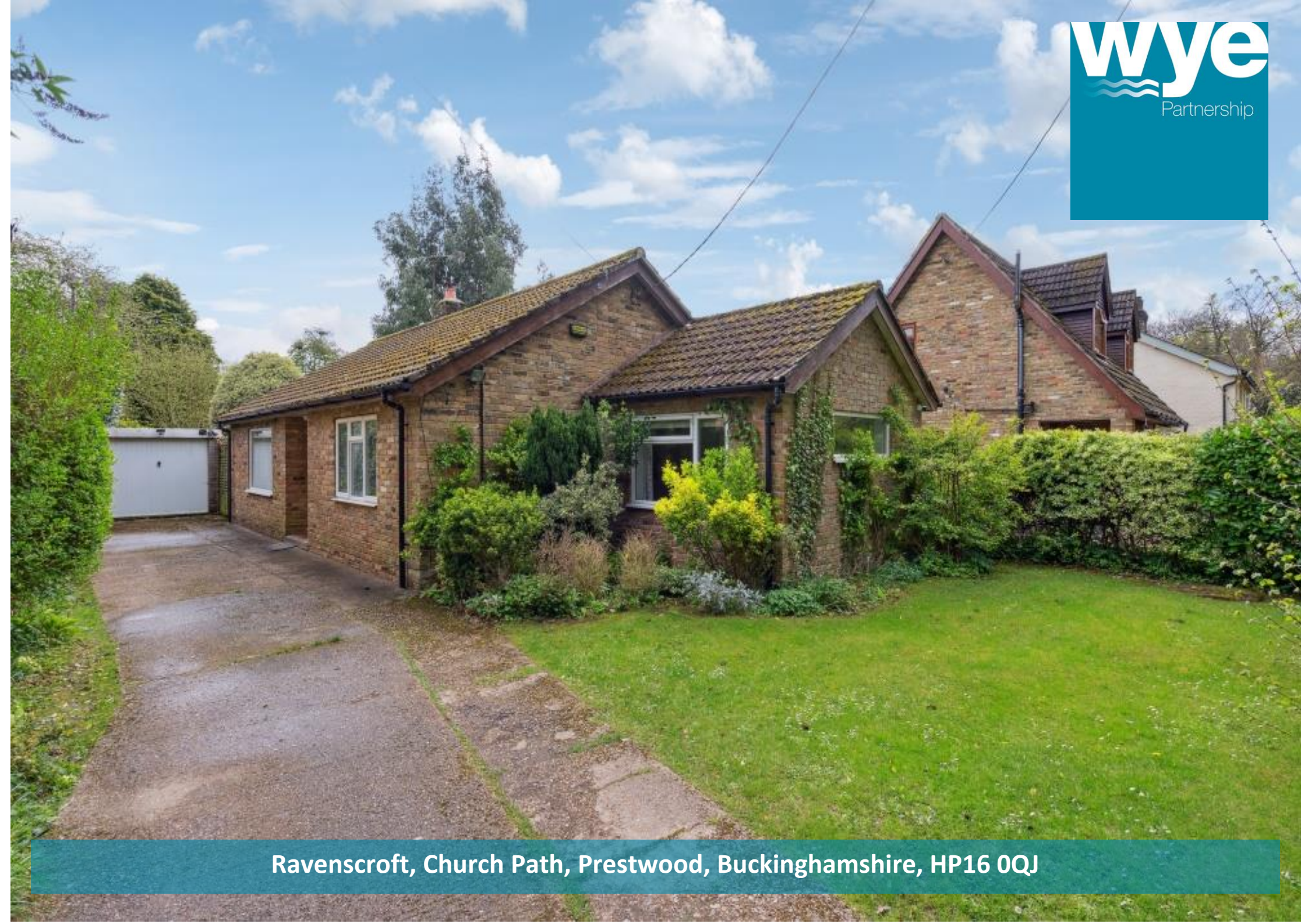
Ravenscroft, Church Path, Prestwood, Buckinghamshire, HP16 0QJ